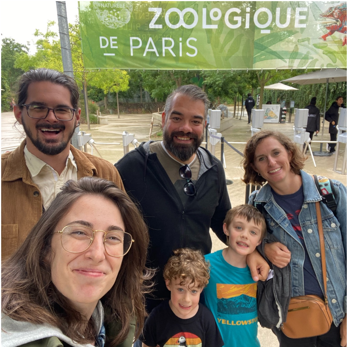
Right before school started, we all spent a day at the Paris zoo together. Tons of fun!